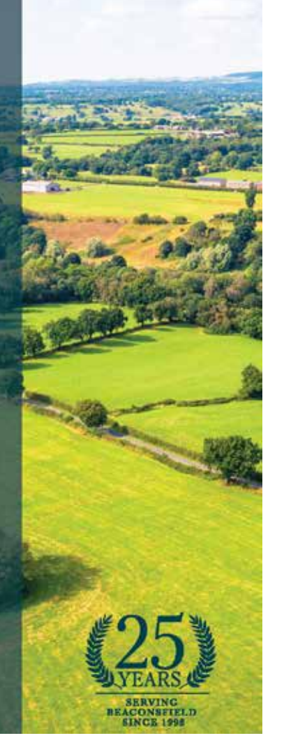
Local Residential Sales & Lettings